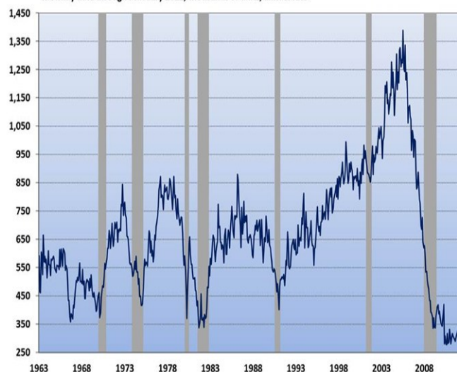
Sales of New Single-Family Homes Monthly data through February 2012, thousands of units, annual rate