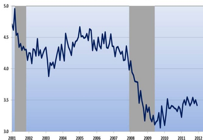
Hiring Rate in Private Industry Hires as a percent of private-sector employment, monthly through December 2011